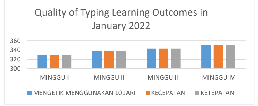
Figure 2. Percentage of results from Quality of Typing Learning

The second is the level of quality of students in the process of learning to type using 10 fingers as seen from the aspect of accuracy and typing speed of each student. There are several students who in the interview process mentioned that every week they have improved the quality of typing 10 fingers. As for describing the percentage of results of the quality of student typing learning, it can be seen as follows;